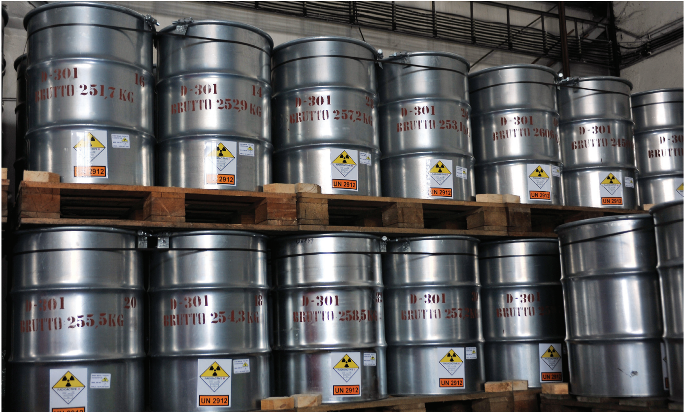
Uranium ore is packed into special, tightly sealed steel drums. Each barrel contains no more than 300 kg of ore when full.

standard for nuclear grade, sinterable \text{UO}_2 powder (ASTM-C 753-04) which is a high (and conservative) purity level. Thus, the introduction of Policy Paper 21 in 2013 retained most of the language in the 2009 PP18 version except PP21 added reference to ASTM-C 753-04—clarifying that any natural UOC meeting the purity specifications for \text{UO}_2 fuel would now be captured under paragraph 34(c). The focus of PP21 is therefore on material—not facilities—and it did not replace PP18's ASTM standards for uranyl nitrate and oxides. It also did not affect uranium in ore and ore residues being processed at milling facilities, which is exempt from IAEA safeguards under Article 33 of INFCIRC/153.