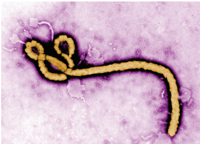
The Ebola virus under a coloured transmission electron micrograph.

States' obligations pursuant to the IHRs are relatively straightforward in theory, including to: designate a na-