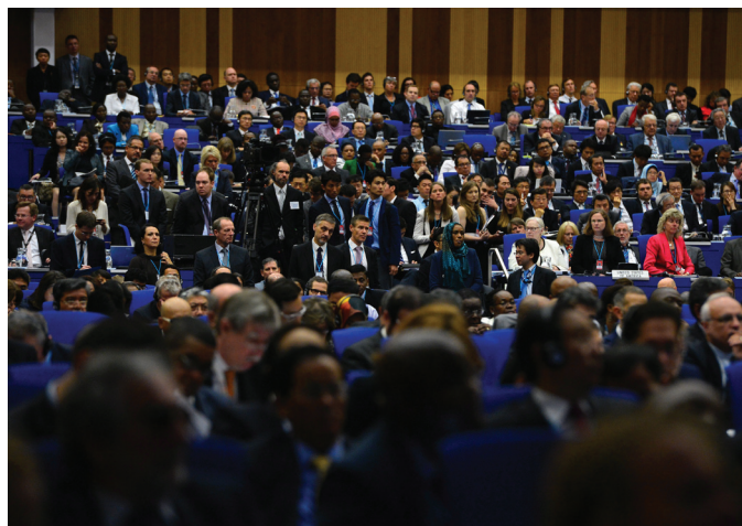
Attendees in the plenary hall during the IAEA’s 58 th General Conference in Vienna, 2014.

Some of the previously contentious issues seem to be becoming less so. The League of Arab States’ draft resolution on Israel’s controversial nuclear weapon programme failed to pass for the fourth year running, facing greater opposition than in 2014—when its passage might have threatened a now defunct dialogue on a WMD free-zone in the Middle East. Even the annual resolution on ‘strengthening the ef-